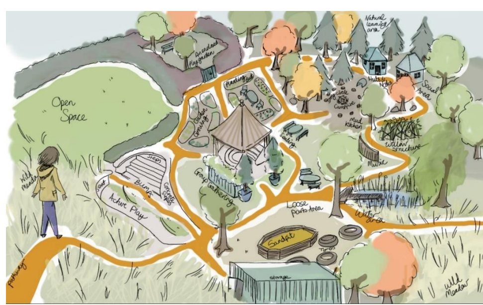
Edinburgh's <u>Vision for playgrounds</u> (illustration by Michaela Lyons)